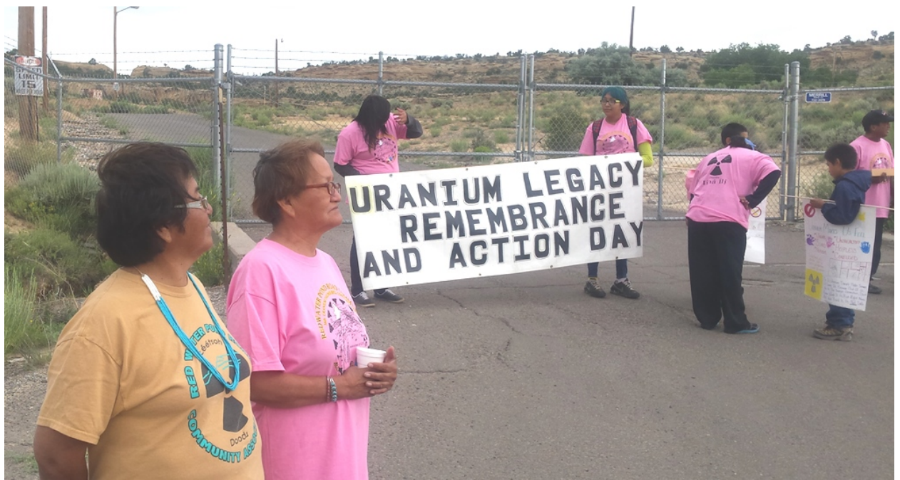
RWPRCA members at the commemoration of the Church Rock Tailings Spill in July 2015.

We remember these unconscionable and horrific events that shaped nuclear history over the past 80 years so that we don't repeat them now and in the future. As the clock on the cover of the Bulletin of the Atomic Scientists reminds us, the world remains only 100 minutes from a cataclysmic nuclear exchange. Please, teach your children this history so they become the vanguards of peace and prosperity for future generations.